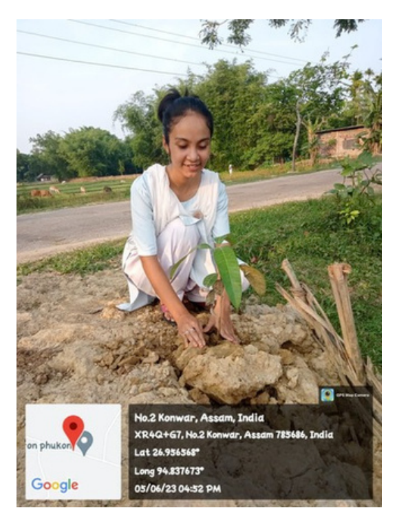
Plantation of saplings