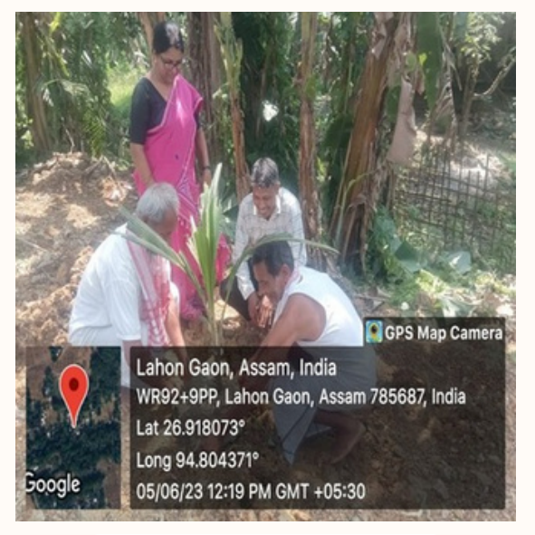
Plantation of saplings