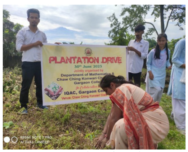
Plantation of saplings