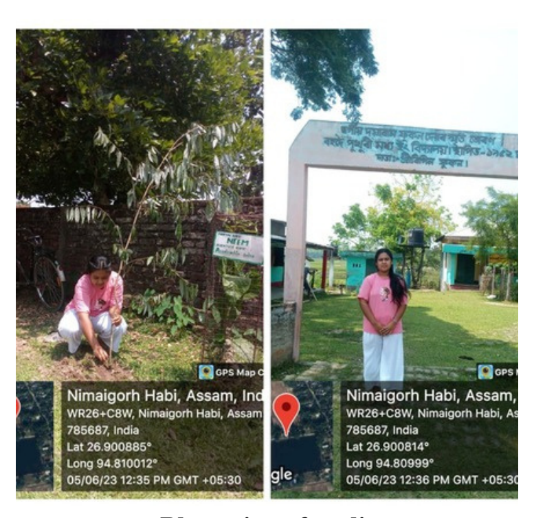
Plantation of saplings