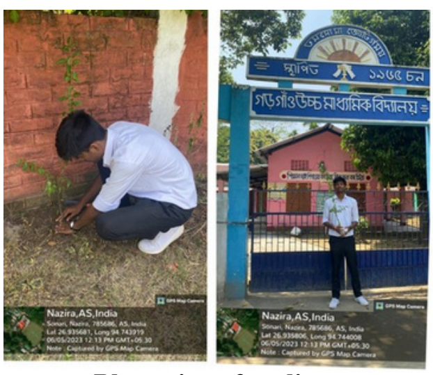
Plantation of saplings