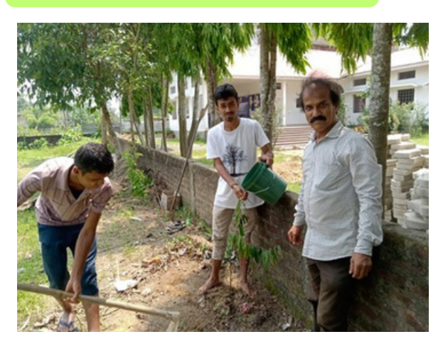
Plantation of saplings