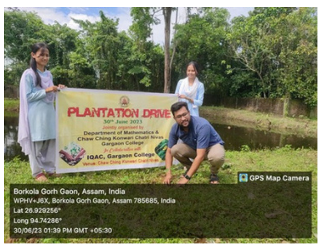
Plantation of saplings