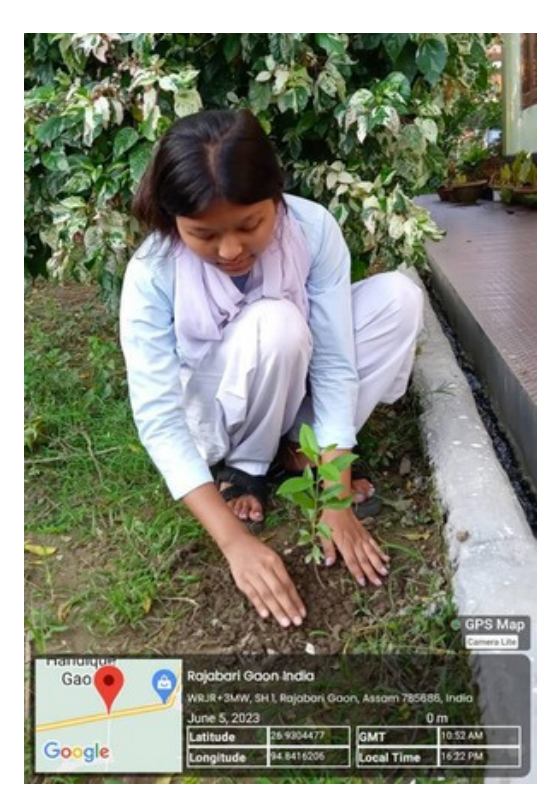
Plantation of saplings