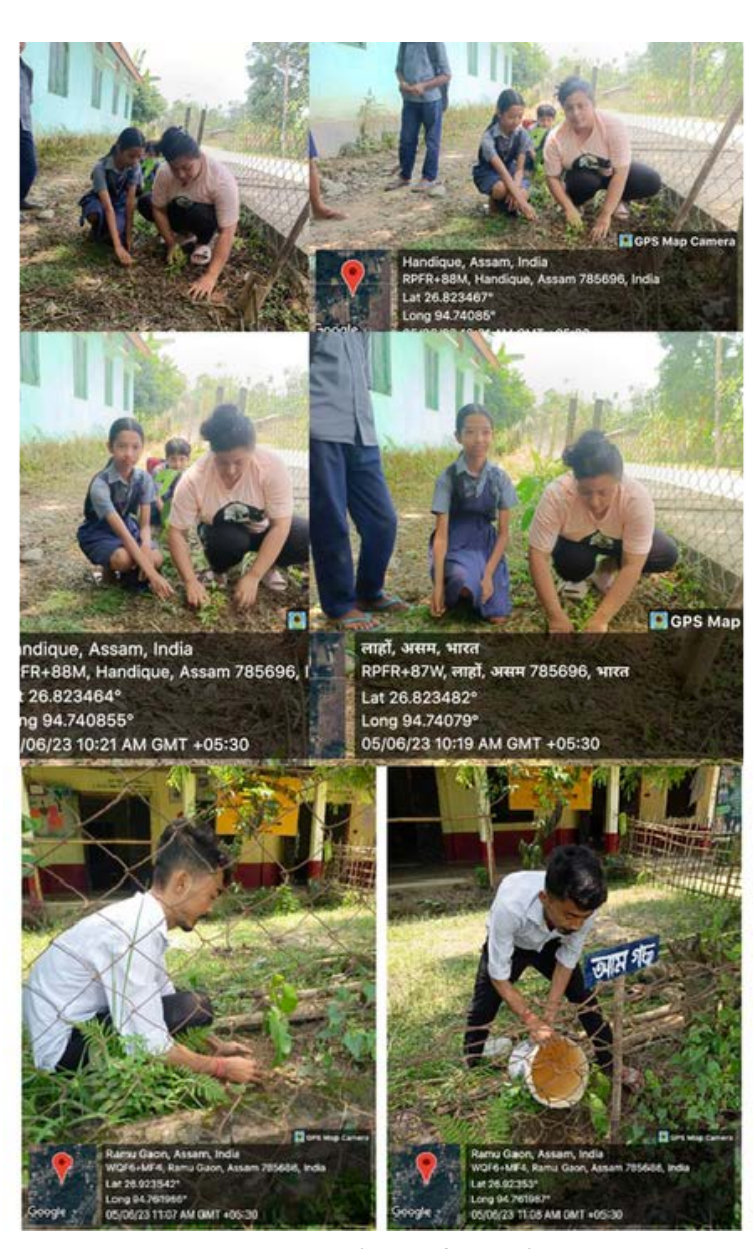
Plantation of saplings