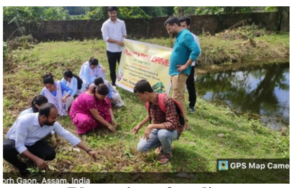
Plantation of saplings