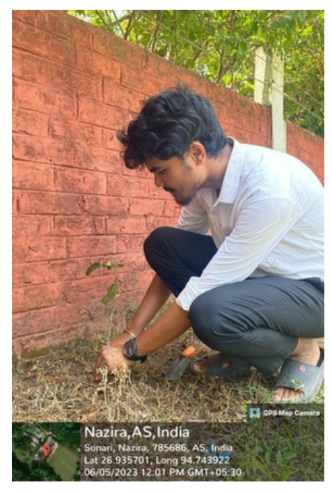
Plantation of saplings