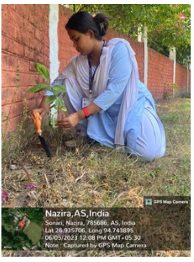
Plantation of saplings