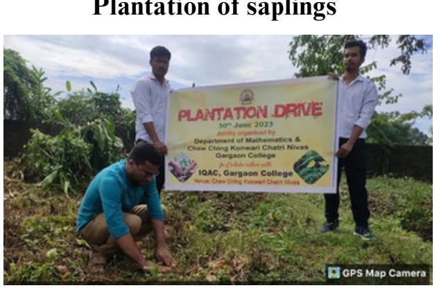
Plantation of saplings