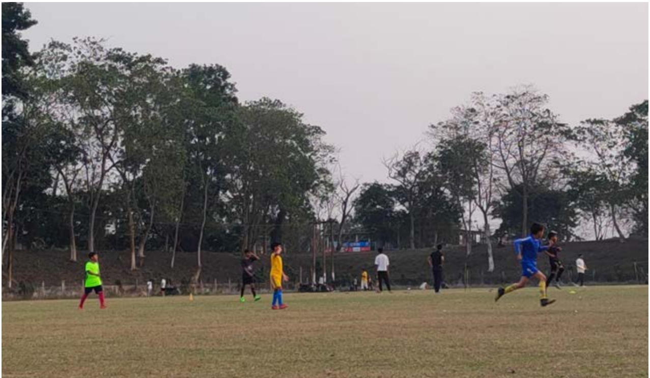
Frame 1 & 2: Cricket Match and Football Coaching on College Playground