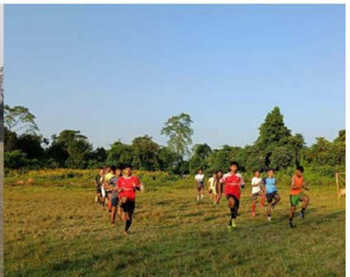
Frame 1 & 2: Indoor Stadium, Frame 3: Volley Ball Court Frame 4, 5 & 6: College Playground